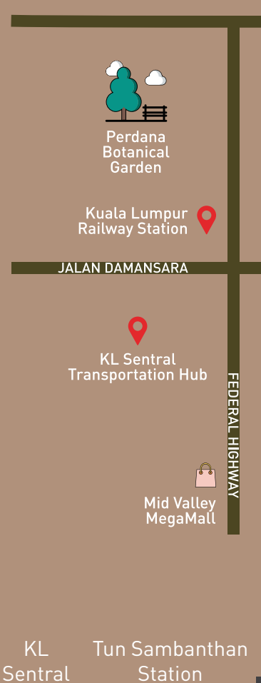
Transportation Hub For KLIA Express Rail Link, KLIA Transit, LRT, KTM Komuter, KTM Intercity & KL Monorail